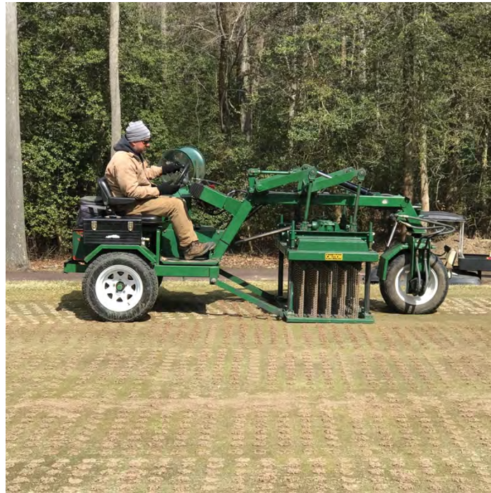
Drill and Fill at Deerwood Country Club