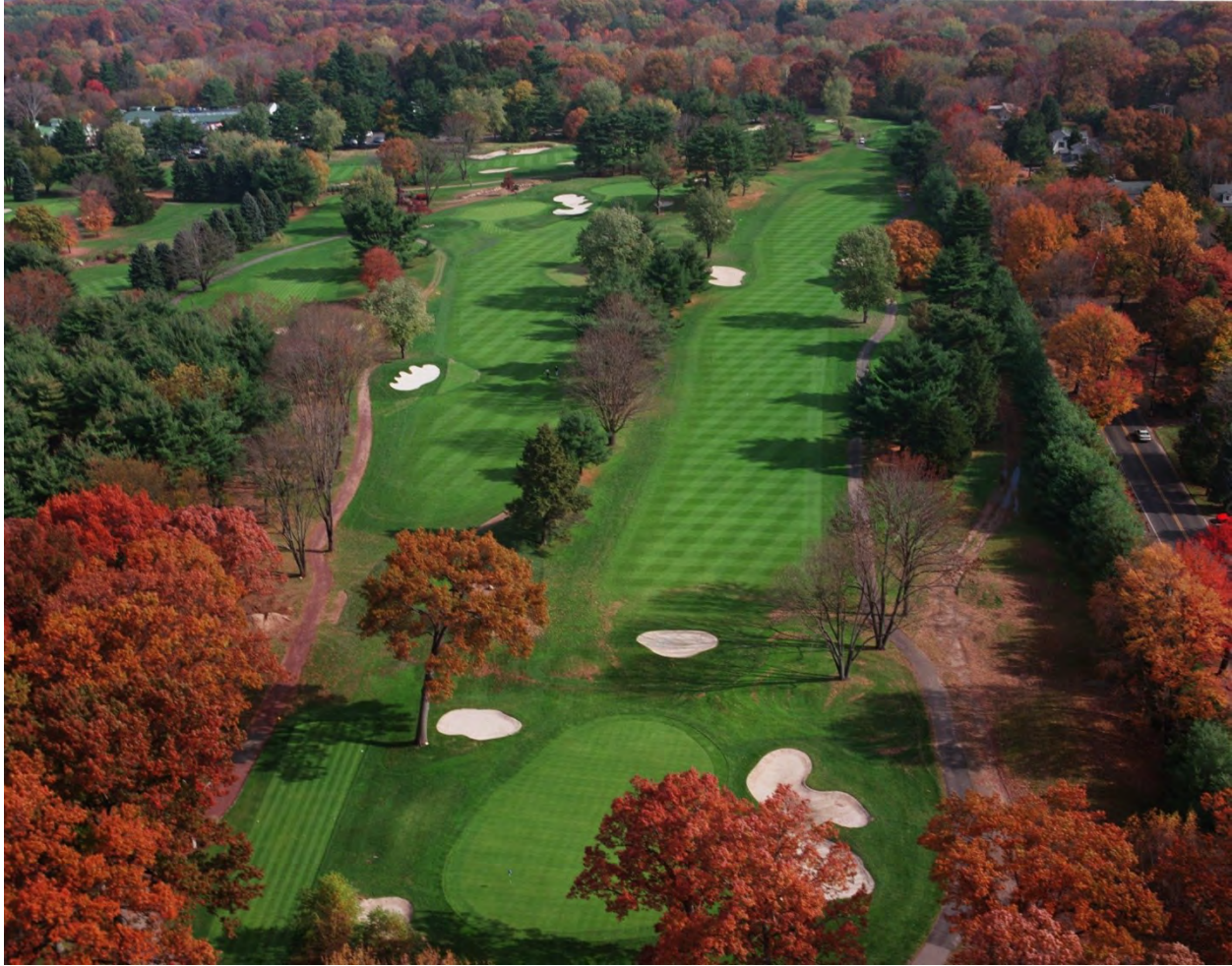
Edgewood Country Club, River Vale, NJ