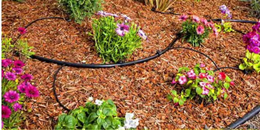
Drip Irrigation in Flower Bed