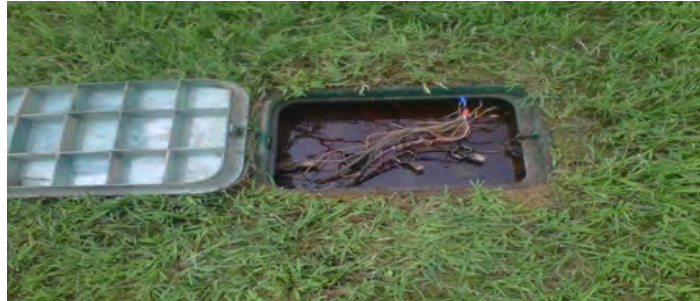
Splices can be Dangerous and Cause System Failures