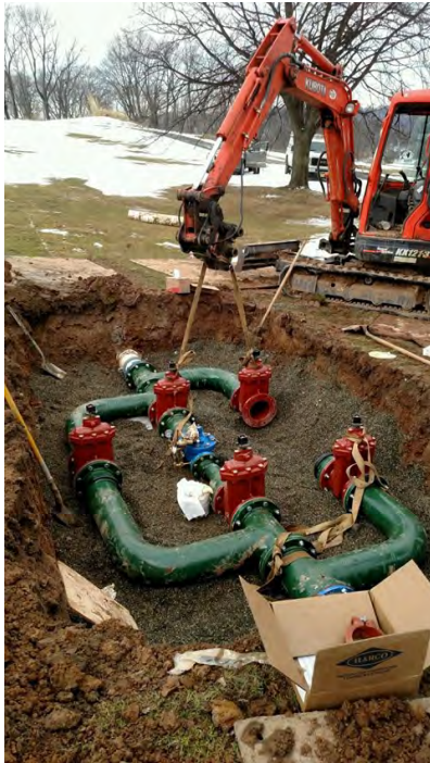
Pressure Reducing Valve Assembly – Montclair Golf Club