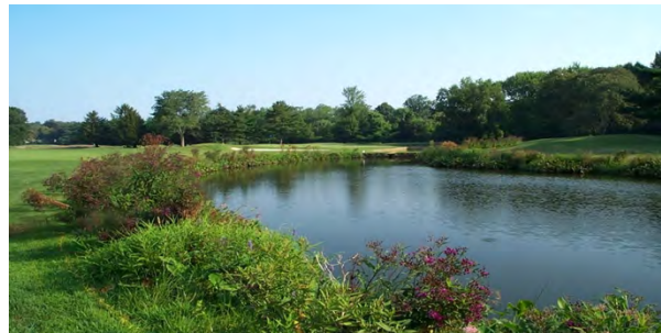
Water Quality/Management Project – Rumson Country Club