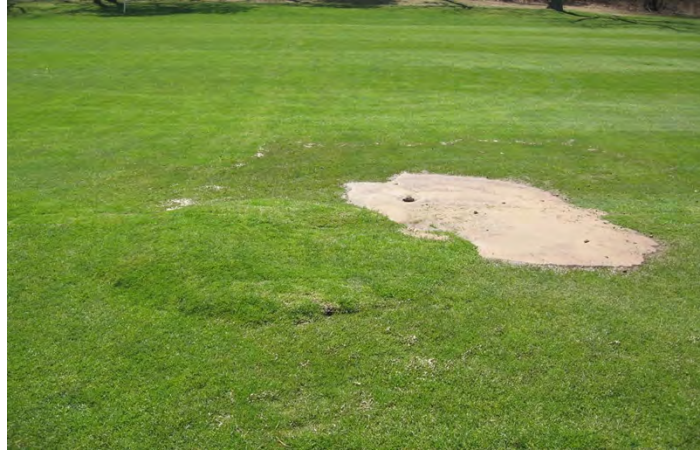
Turf Bubble and Sand from Main Line Leak