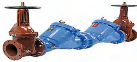
Reduced Pressure Zone Backflow Preventer