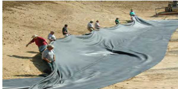
Pond Liner Installation