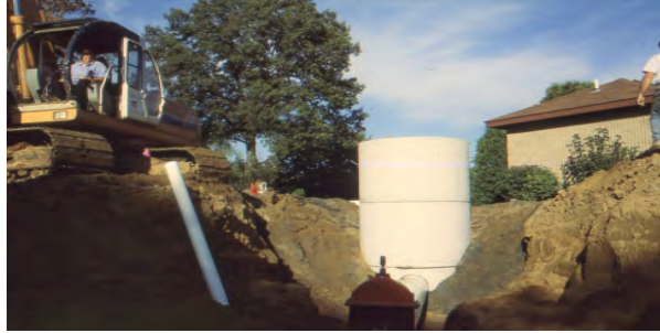
Gate Valve on Intake Flume – Beacon Hill Country Club