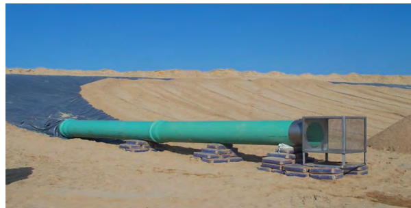
New Pond/Pump Intake with Box Screen