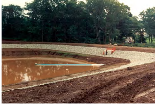
Effluent Pond - Stanton Ridge Country Club