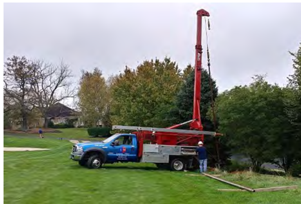
Well Drilling Rig