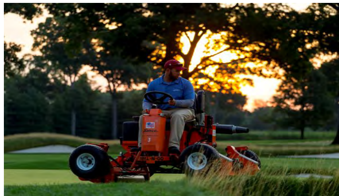
Greens Rolling- The Ridgewood Country Club