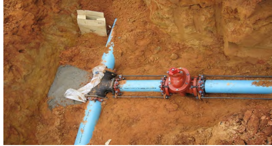
12-inch Mainline Pipe with Thrust Block and Tie-rods – Beacon Hill Country Club