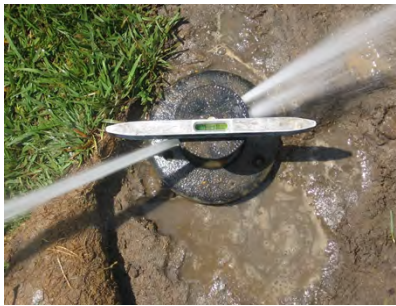
Sprinkler Head installed Plumb and Level