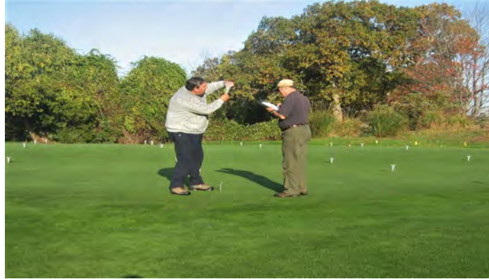
Green Irrigation Audit – Lakewood Country Club