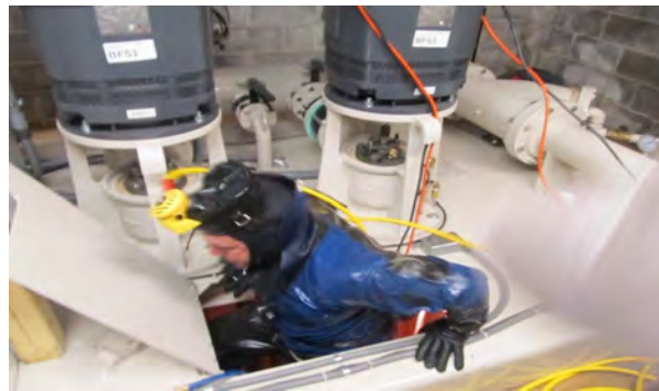
Diver Entering Wet Well to Examine Intake Baskets on Vertical Turbine Pumps