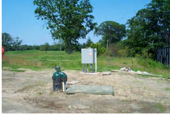
8-inch Cased Well – Deal Golf & Country Club